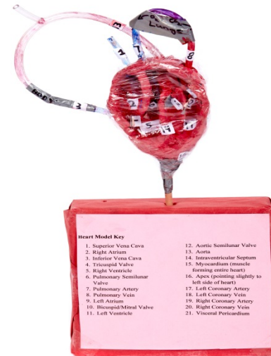
Figure 2: Some examples of heart models constructed by students as part of the heart unit. Students were given 4 weeks and had to get their project design approved before construction. All models were life sized.