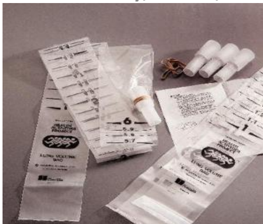
Figure 1: Lung Volume Bag set to measure lung capacity (Ward's Science 145051, 145068, https://www.wardsci.com/store/catalog/product.jsp?catalog_number=145051&sk=1 )