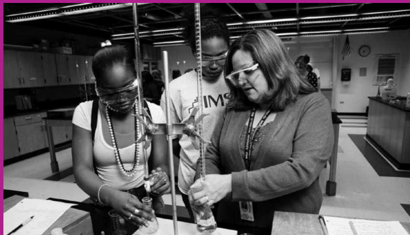
Figure 2. All first-year IMSA students enroll in the Methods of Scientific Inquiry course, which shapes the nature and quality of their scientific thinking, Aurora, 2008.