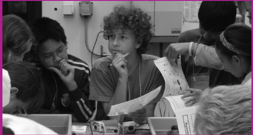
Figure 1. Inquiry-based, problem-centered enrichment opportunities, beginning in the early years, foster interest and talent in STEM learning experiences, Aurora, 2008.

rienced "real science" in a way that was entirely new to him; in "school science," he had quickly completed his work only to be given more worksheets, told to read, or asked to help "slower" students. In IMSA FUSION he thrived, challenged by hands-on experiments, active discussions with other students, and engaging dialogue with his teachers and parents. These experiences not only advanced his knowledge and skills, but also motivated him to excel and seek further IMSA opportunities (see Figure 1).